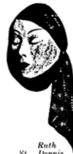
Ruth St. Dennis