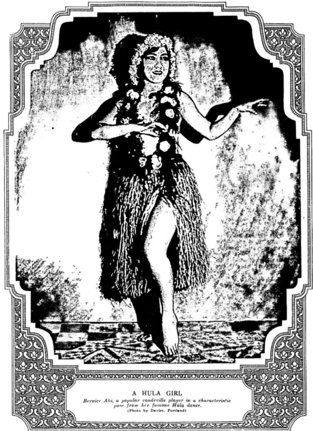
A HULA GIRL

Bernice Ahi, a popular vaudeville player in a characteristic pose from her famous Hula dance.