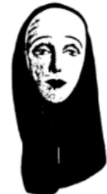
Lady Diana Manners