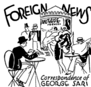
Correspondence of GEORGE SARI

Such is the significance of the cheer week and the harmony of the people of Salt Lake City, Utah.