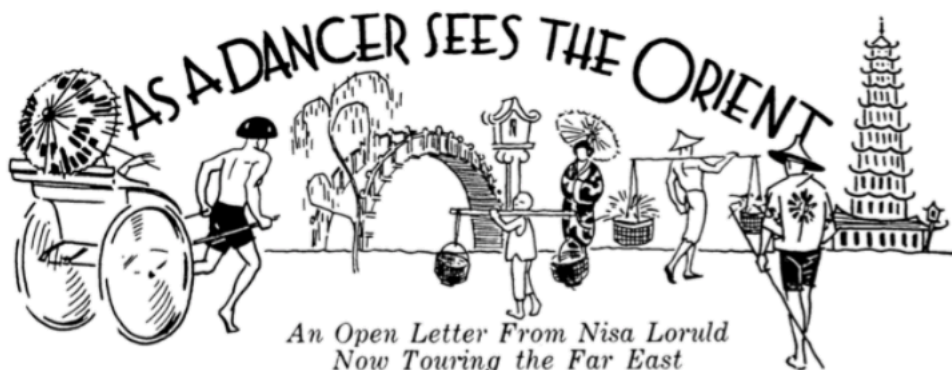
An Open Letter From Nisa Loruld Now Touring the Far East