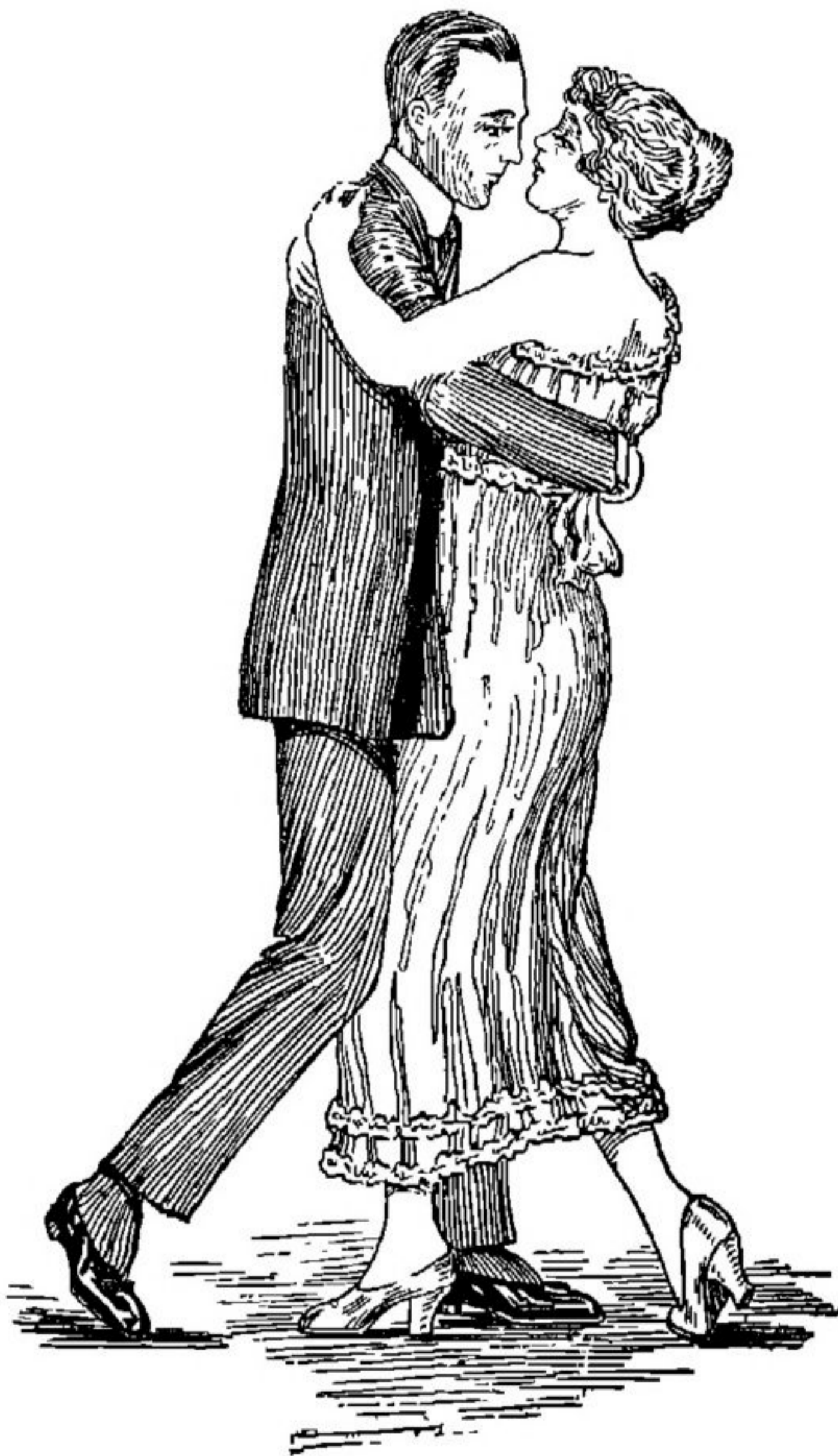
Correct Position in All Round Dances.